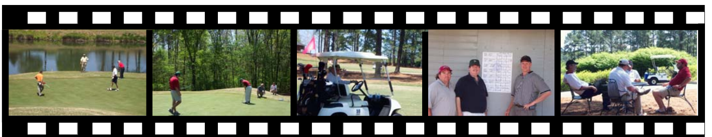
Scenes from Tom Frazier Golf Classic