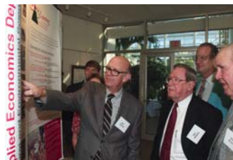
Former Faculty Reminiscing