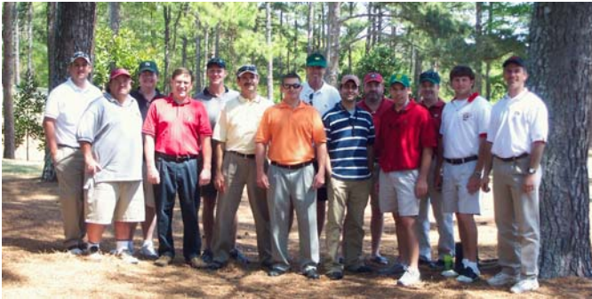
Some of the Golf Tournament Participants