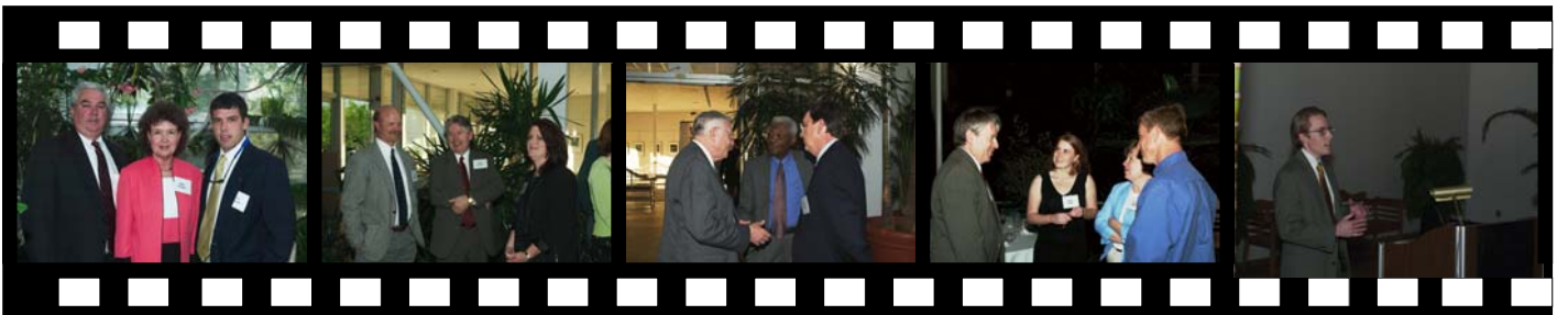
Scenes from the ConnerConnects Banquet

Your career choice would be of interest to current and prospective students. Please tell us about it by answering the short survey included with this newsletter and returning it to Department of Agricultural and Applied Economics, 301 Conner Hall, University of Georgia, Athens, GA 30602-7509. Your updated information will be posted on the departmental website. The survey may also be downloaded and emailed to aaecon@agecon.uga.edu . Thank you for your participation!