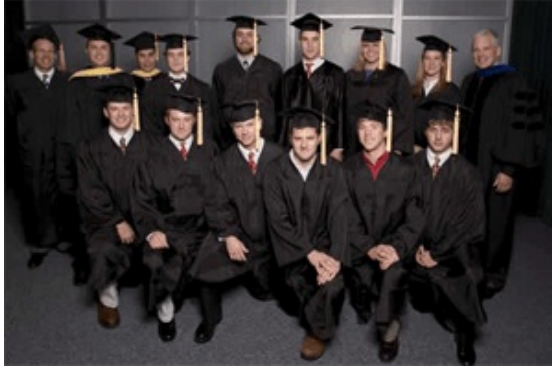
Graduation Class - Fall 2008