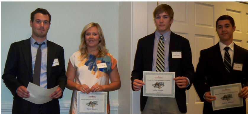
← ↗ Scholarship Recipients