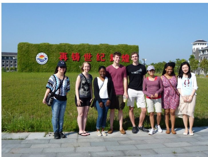
Study Abroad Group at Shanghai Ocean University.