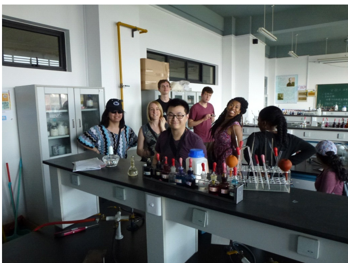
Students visiting labs at Shanghai Ocean University.