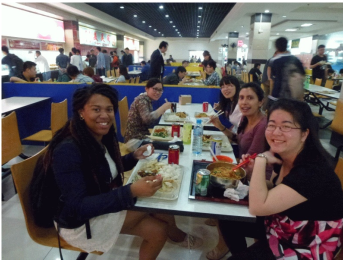
Lunch at the Shanghai Ocean University cafeteria.