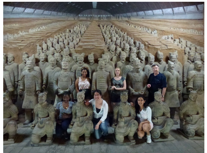
Students visiting the Terracotta Warrior's Museum on the optional trip to Xi'an.