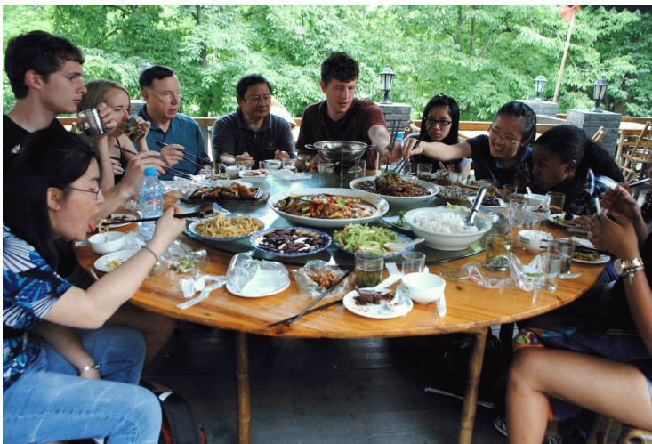
Lunch at a rustic restaurant at the tea museum in Hangzhou City.