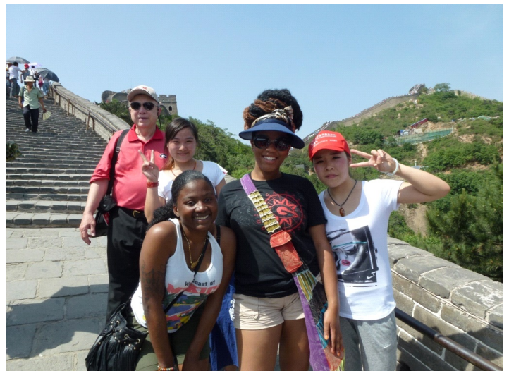
Cross-cultural understanding on the Great Wall of China.