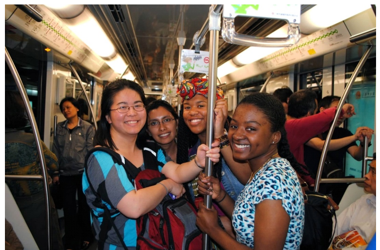
Students on the Shanghai Subway, on their way to People's Square.